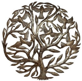
The Tree of Life

Lash Tint $17. 00 Brow Tint $13. 00 Brow Shape $12. 00 Eye Trio: Brow Shape, Lash & Brow Tint $39. 00